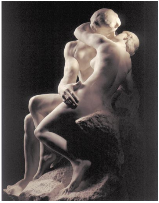
Figure 2 The Kiss: the couple in Auguste Rodin's masterpiece are turning their heads to the right to kiss each other.

The Mars Global Surveyor's Thermal Emission Spectrometer has identified two global spectral surface types in martian dark regions, which were initially interpreted as being of basaltic (type 1) and intermediate (type 2, basaltic andesite to andesite) volcanic composition<sup>1</sup>. Wyatt and