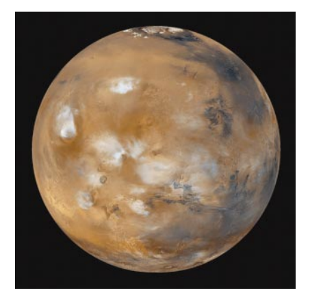
Mars, seen from the Mars Global Surveyor orbiter. The distribution of surface rock types gives clues to the planet's geological evolution.

Type-2 spectra characterize extensive areas of Mars, including the southern highlands<sup>1</sup>, and are present in vast contiguous areas up to 1,000 km outside and 2 km higher in elevation than the putative "shoreline" boundaries<sup>1</sup>. Wyatt and McSween dismiss these incongruities and do not explain them<sup>2</sup>; no explanation is provided either as to how the Pathfinder landing-site analyses fit into the weatheredbasalt hypothesis<sup>2</sup>. Some interpretations of Pathfinder data identify these as andesitic